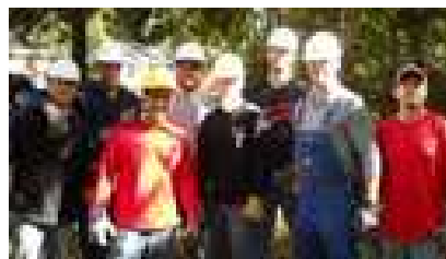
Building houses and looking good at the same time

“When unto the end we’ve come, And behold the setting sun, our thoughts shall be high, of Kappa Psi”.