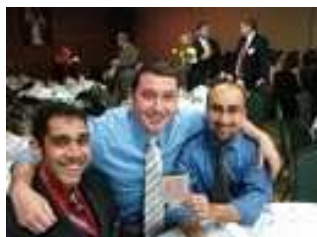
Brothers enjoying winter conclave