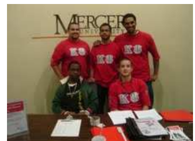
Gamma Psi's Red Cross Blood Drive at Mercer