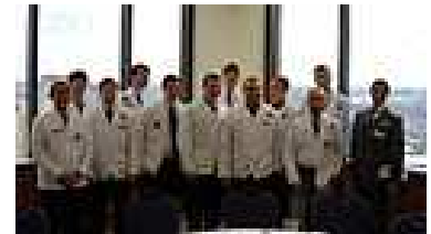
Brothers out in force for GPHA's VIP day at the Capitol

on both the part of the individual and on the part of the brotherhood each to one another. Without the individuals putting forth their own hands we can never achieve the hundred hands extended to lift each other up. It has also been said that you get out of the fraternity what you put in. If you quit giving your time, money, and talent to the fraternity after