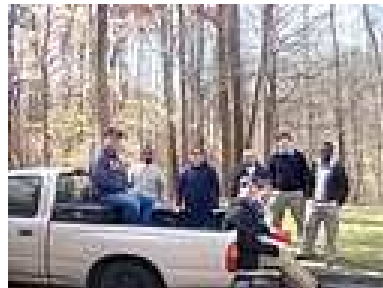
Roadside cleanup with our new pledges